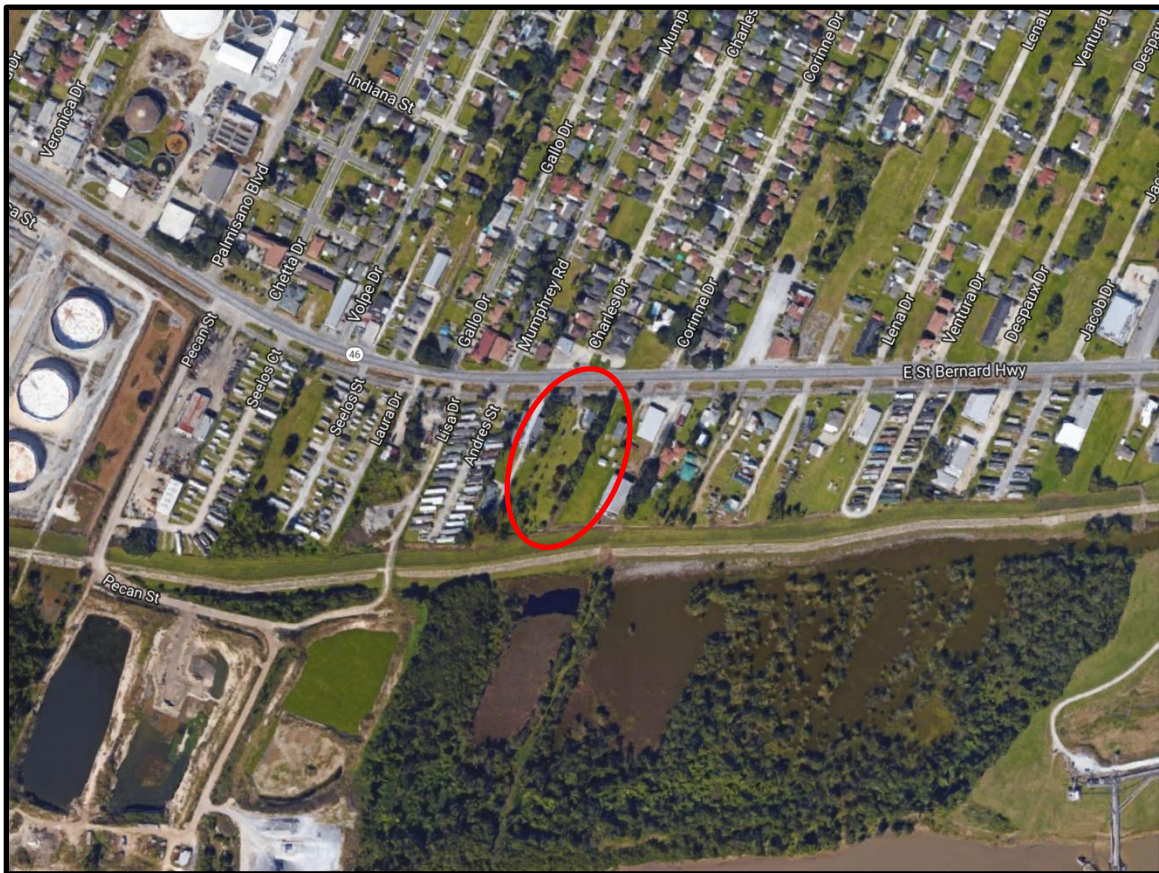
Figure #1: 1 st Potential Zone 2 Park Site Location

Two (2) potential sites have been chosen by the Department of Community Development. Both of the potential sites are located in what essentially would be considered park “deserts”, having no other public recreational facilities in the immediate vicinity. As shown below in Figure #1, the first potential site is located on the riverside of E St. Bernard Highway and east of Chalmette Refining. This site comes with acquisition challenges as it is owned by multiple private individuals.