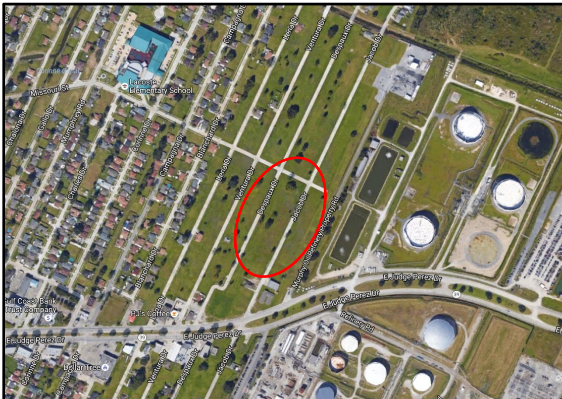
Figure #2: 2 nd Potential Zone 2 Park Site Location

The second proposed site in Zone 2 is located north of E Judge Perez Drive, near Lacoste Elementary and adjacent to Valero Refining as shown below in Figure #2.